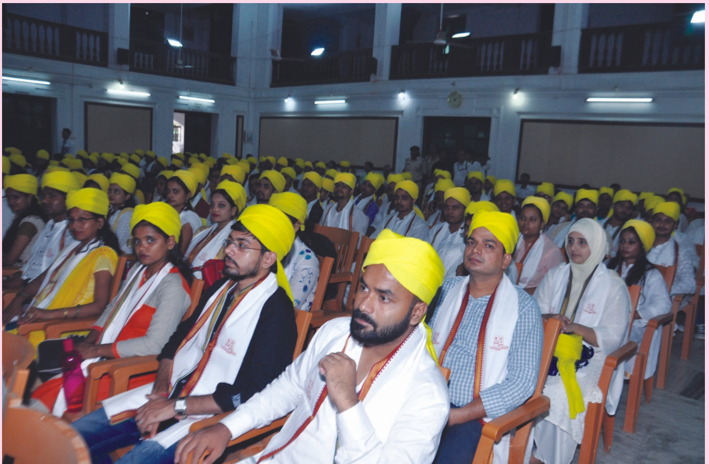
Candidates present at first Convocation Celebration - 2019