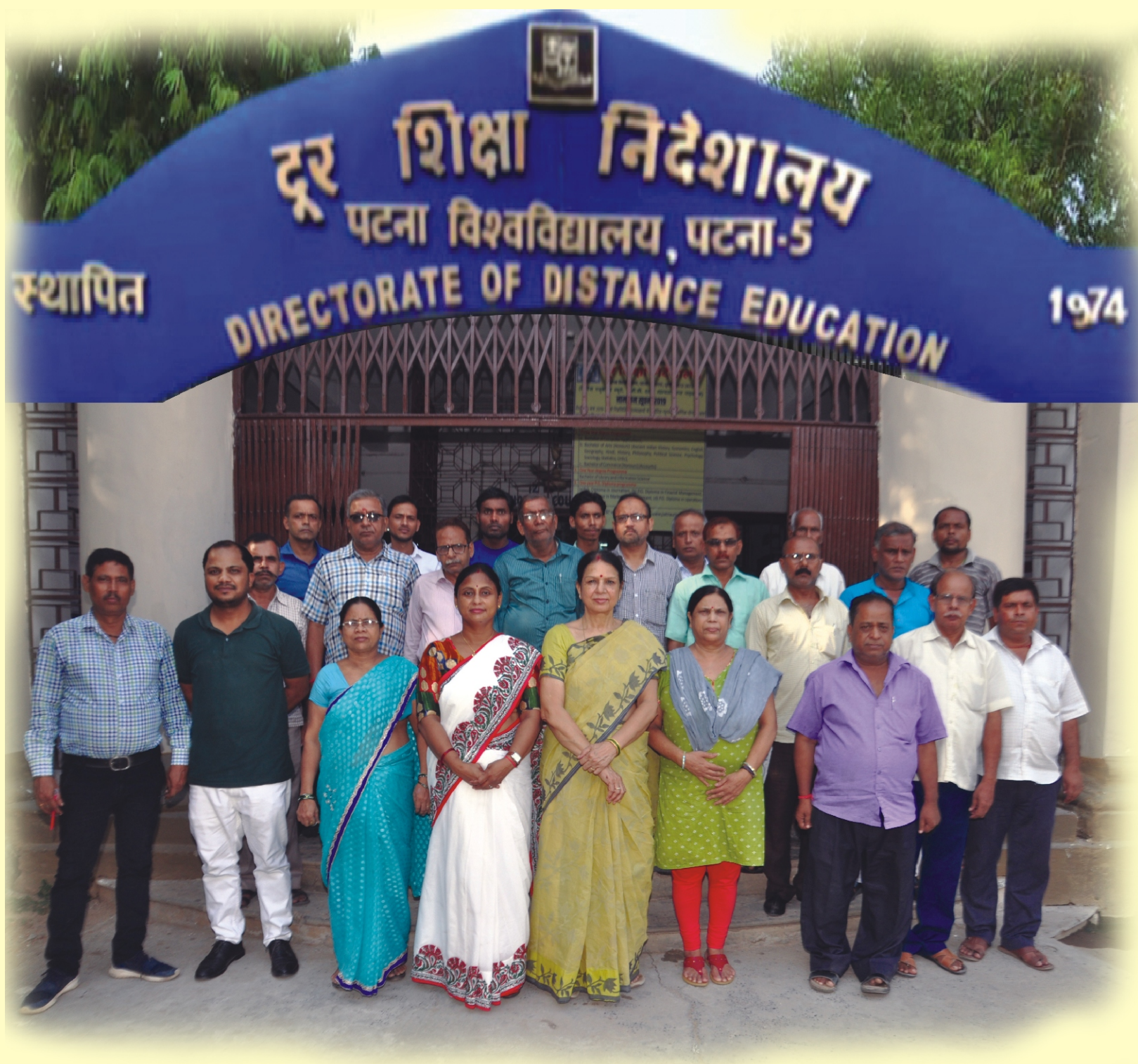
Officer & Staff Photograph