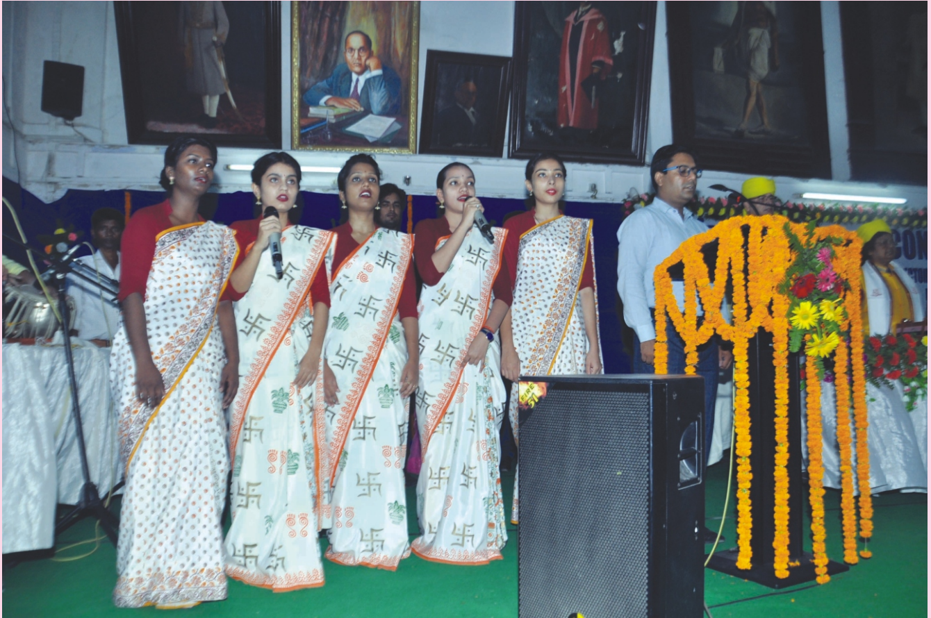
Students Singing Patna University Kulgeet Song.