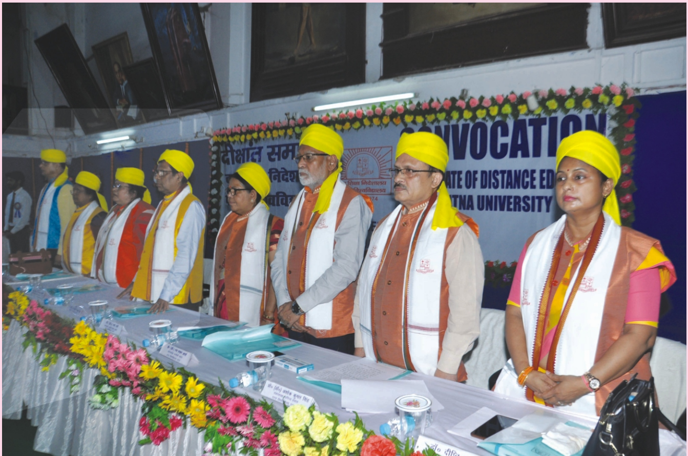
The Guests on the Dias.