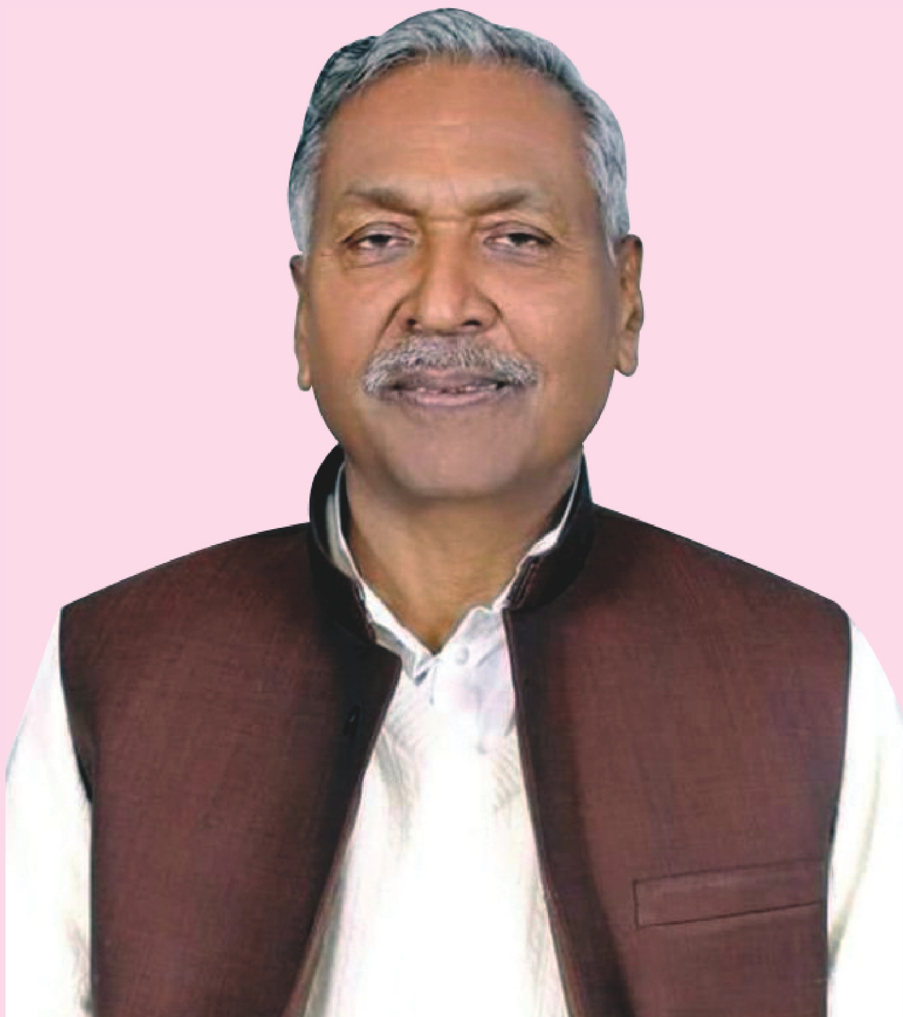
Chancellor Shri Phagu Chauhan H.E. the Governor, Bihar